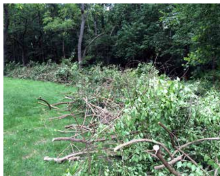
Our perennial activity – removing honeysuckle – continues.