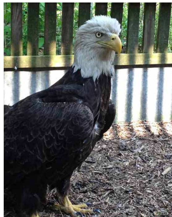
This beautiful adult eagle from Grand Lake St. Mary's became a permanent resident after losing the end of its wing.