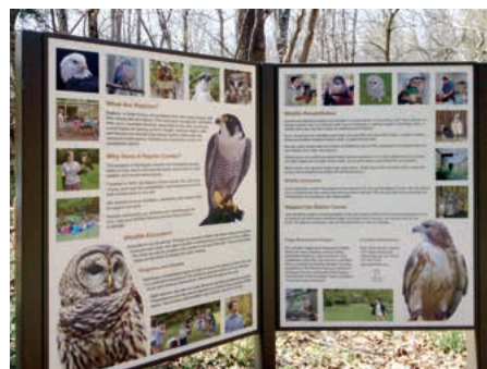
New interpretive signs greet visitors to the Raptor Center

For the seventh year, we provided schol- arship funds to enable economically disadvantaged children from Dayton and Springfield to attend the Outdoor Edu- cation Center. The funds, with support from individual donors and charitable foundations, allowed 400 children from 9 schools to participate in our residential environmental learning programs.