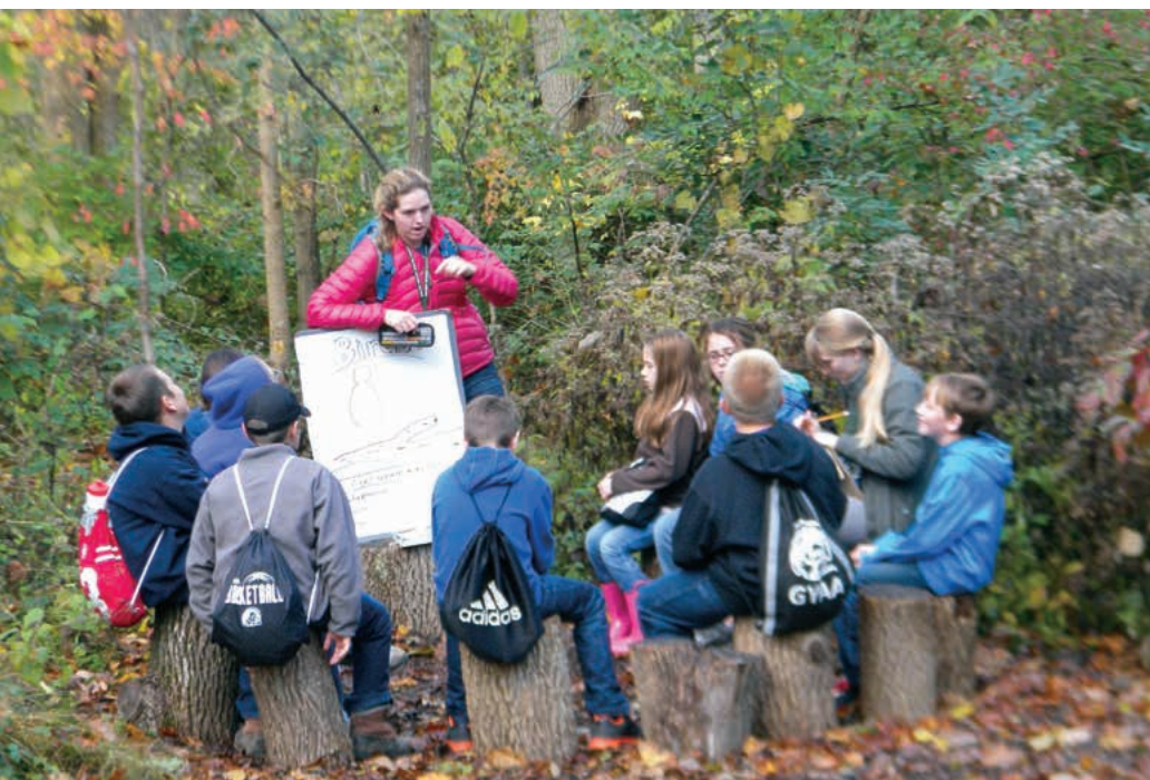
Outdoor school students talk about ecology before a hike in the Glen