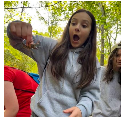
A visiting student finds a crayfish while doing a stream study