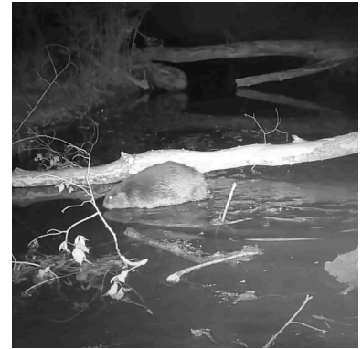
Glen Helen beaver footage captured by University of Dayton researchers

We're both looking out for the next generation: The beavers are building habitats to sustain their family, and we are building programs to teach children to understand, respect, and steward our environment. After closures and changes in response to COVID, we brought back our residential Outdoor